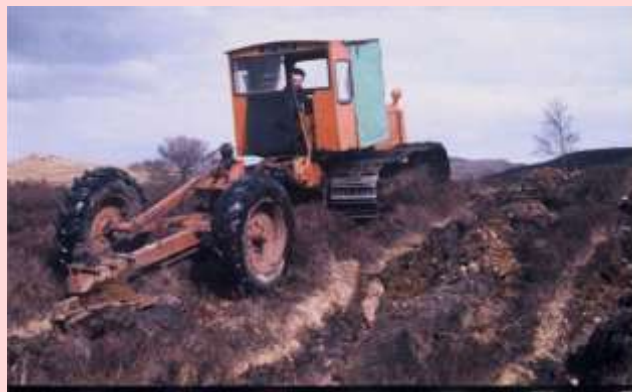
Deep ploughing of ironpan podzols for forestry

On the National Soil Map of England and Wales, podzols with ironpans are dominant or common in the following associations: