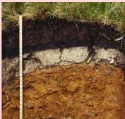
Ironpan at base of the white horizon

In our uplands and moorlands, podzols with an organic topsoil and ironpan (Bfe horizon) are widespread and are increasingly likely to be the subject of catchment management programmes, including tree planting, enrichment of biodiversity and landscaping around wind turbines. In places the ironpan can obstruct rooting and drainage and may need to be ruptured, particularly for tree planting. Traditionally, for forestry, this was done by deep ploughing to invert the soil profile and create furrows to discharge water. This practice is undesirable as it increases catchment run-off and damages the integrity of the organic topsoil, releasing carbon. Where an ironpan needs to be ruptured, subsoiling with close-set tines, rather than deep ploughing, is preferable. However, some ironpans are discontinuous and do not impede rooting and drainage, so it is essential that a detailed soil survey, with profile observation pits is made, as part of planning site works, so that no unnecessary, and potentially damaging cultivations are carried out. These moorlands are often rich in the remains of human occupation from the Bronze Age and earlier and so an archaeological survey should be carried out before the soils are disturbed.